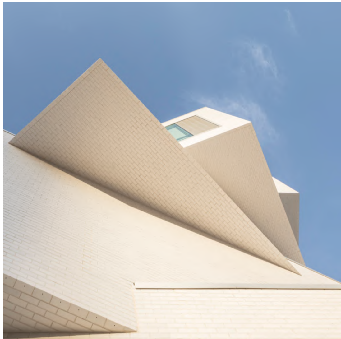
Heights Building schoolhouse, Virginia. A project by BIG - Bjarke Ingels Group.