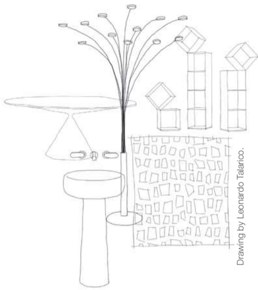
Drawing by Leonardo Talarico.

After the long stop that blocked the Milan Design week in April 2020 and 2021, the city and all its activities will restart in September with renewed enthusiasm. Superstudio will present an edition of rebirth, of change, of a new format, of Made in Italy, of the glance on new horizons of the world, of thematic and curatorial exhibitions, of Women, of human technology, of digital and virtual.