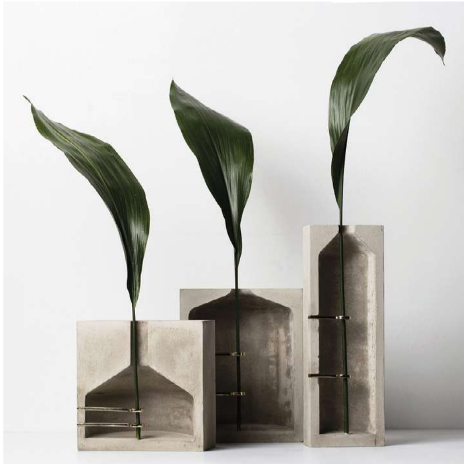
1000 Vases: Vase M, by Iludi.